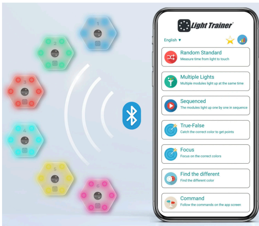
Figure 1. Light Trainer Pro system.

Figure 2 shows the hand visual response times of volleyball and football players. No significant difference was found in the comparison of hand